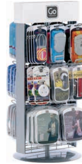
TWO SIDED SPINNER (SMALL)