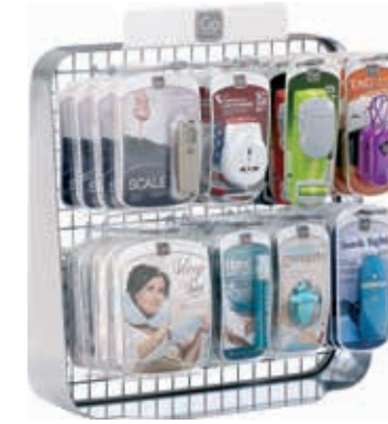
COUNTER TOP UNIT