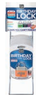
SINGLE PRONG COUNTER STAND