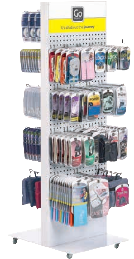
DUO STAND (WITHOUT PILLOW STATION)