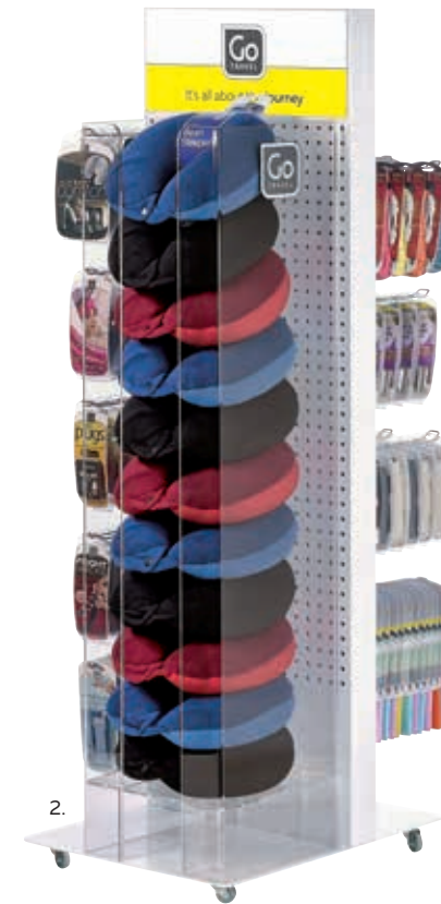
DUO STAND (WITH PILLOW STATION)